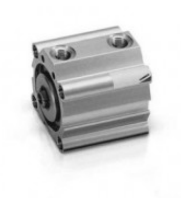
Description DF-302 Air cylinder

Pneumatic cylinder with guides manufactured in the external profile parallel to the sliding axis on three sides. These are used to locate the switches that sense the piston position. The non rotating guides make this pneumatic cylinder suitable for specific applications.